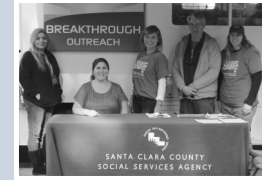
CalFresh Outreach Page 10