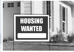
Housing Services Page 4