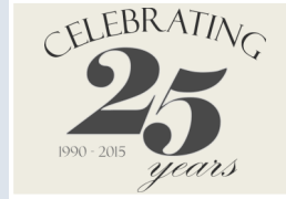
Client Achievement Page 8