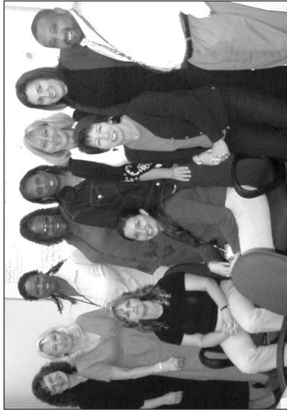
The Shared Leadership Task Force April 2004