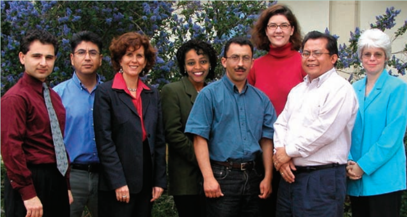
Human Services Department

We enjoy watching the people we serve thrive and our communities grow stronger. Our jobs are meaningful and provide us with the opportunity to offer the highest quality service to the residents of Santa Cruz County. We strive to treat all people with respect, dignity and fairness.