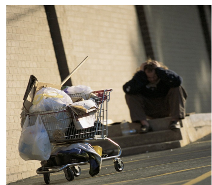
196 Number of people assisted who were literally homeless and placed in housing