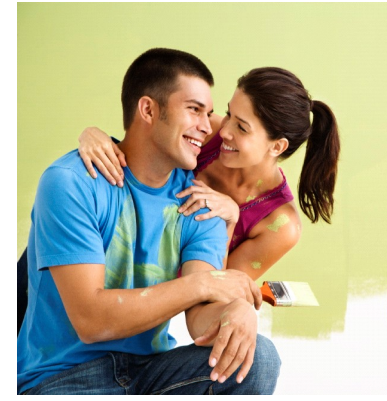
381 Number of people helped to prevent homelessness