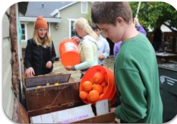
Fresh Produce Gleaning Program