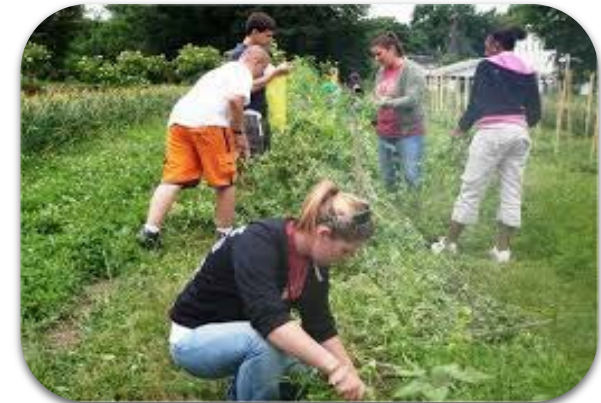
Community Garden at Foster Youth Site