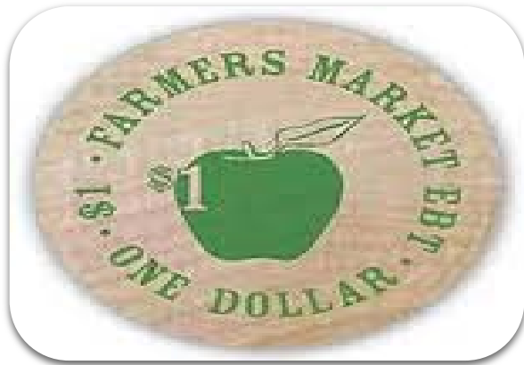
EBT/CalFresh at Farmers' Markets