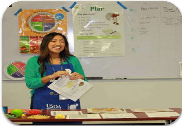
Nutrition Education at CalFresh/CALWORKS offices