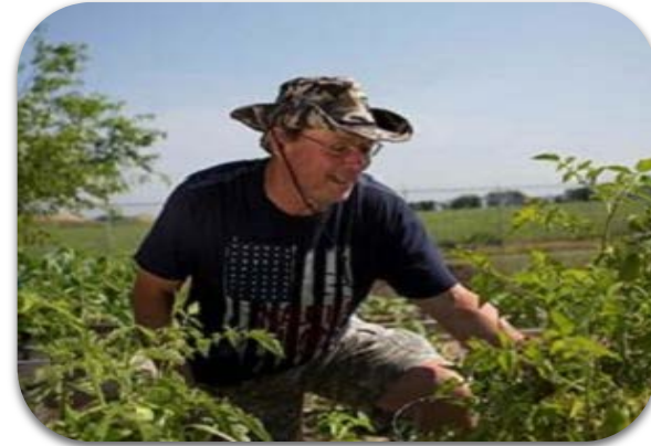
Nutrition Education targeted to veterans