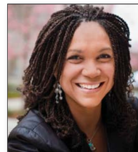
Melissa Harris-Perry Political Science Professor, Tulane University