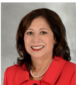
Hilda Solis 1st District