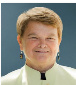
Sheila Kuehl 3rd District