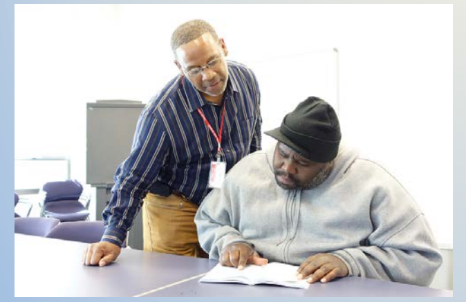
Peer support for re-entry clients

Support groups offer a network of help during challenging times