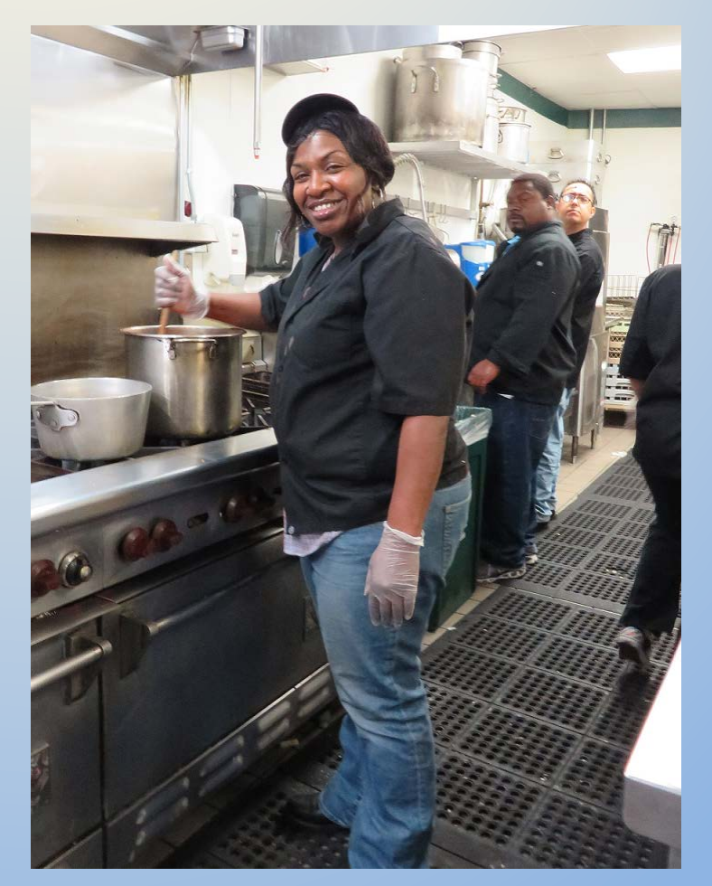
AB 109 client working at the Catering Connection