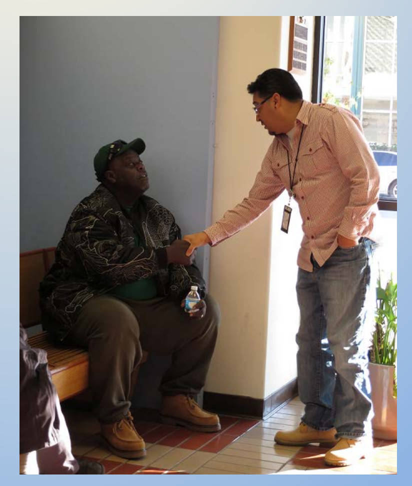
HSA Social Worker talking to a client