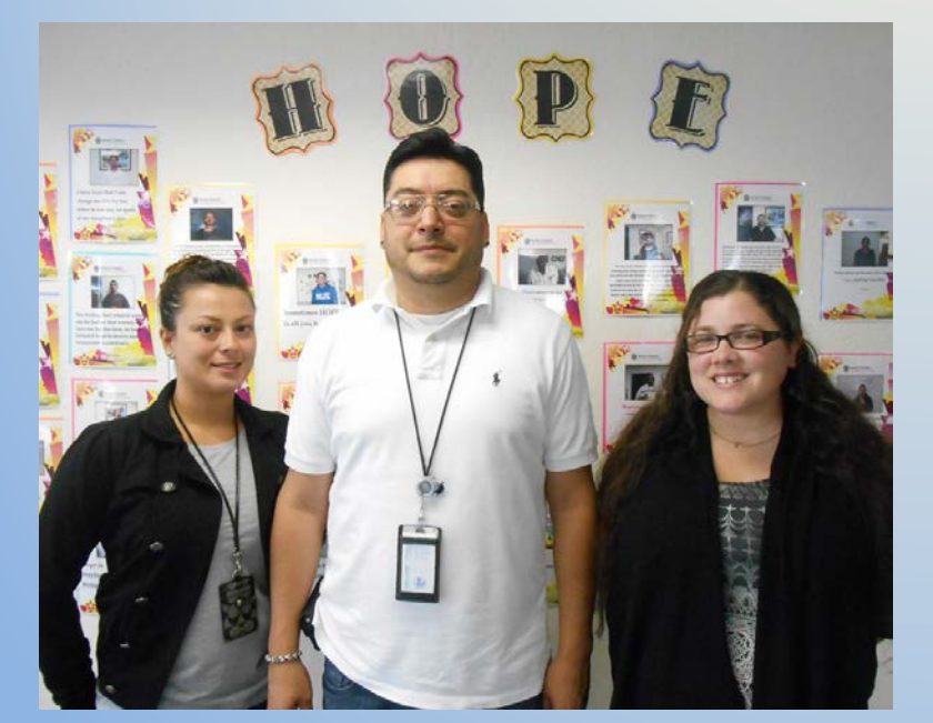
Service Connect Social Workers