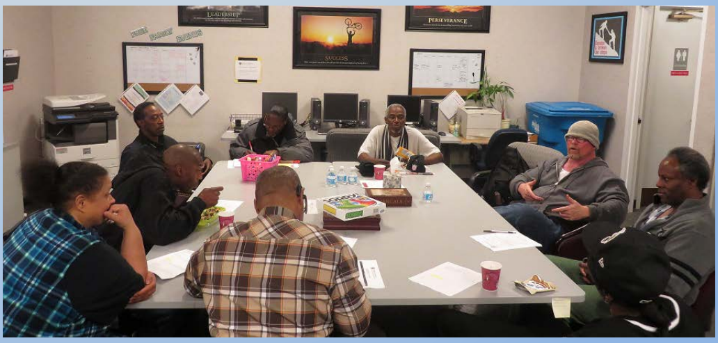
Service Connect support group meeting

Peer support from formerly incarcerated individuals who successfully re-enter the community