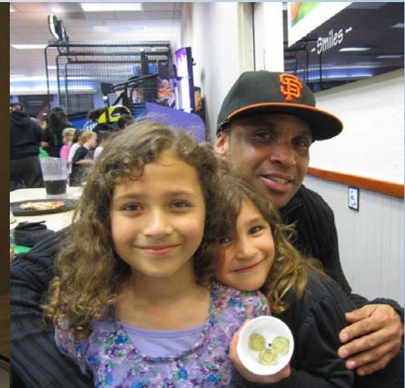
Client re-engaging with his kids