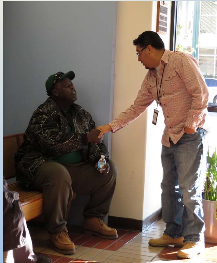
HSA Social Worker talking to a client