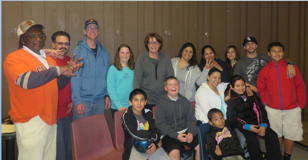
Sponsored family bowling night