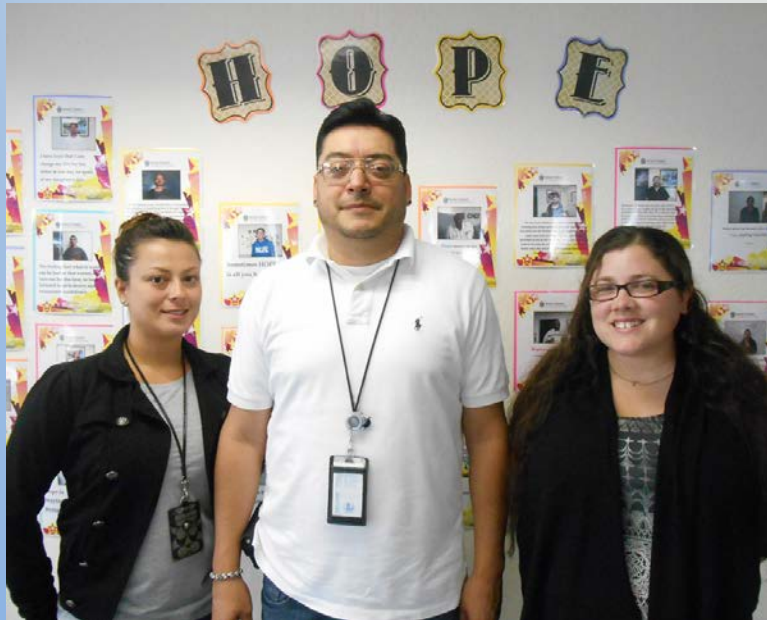
Service Connect Social Workers