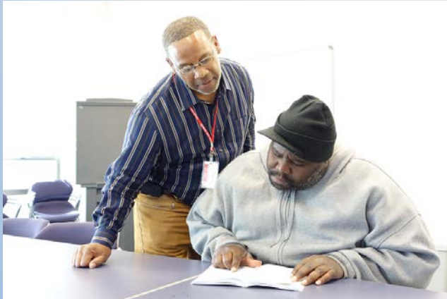
Peer support for re-entry clients