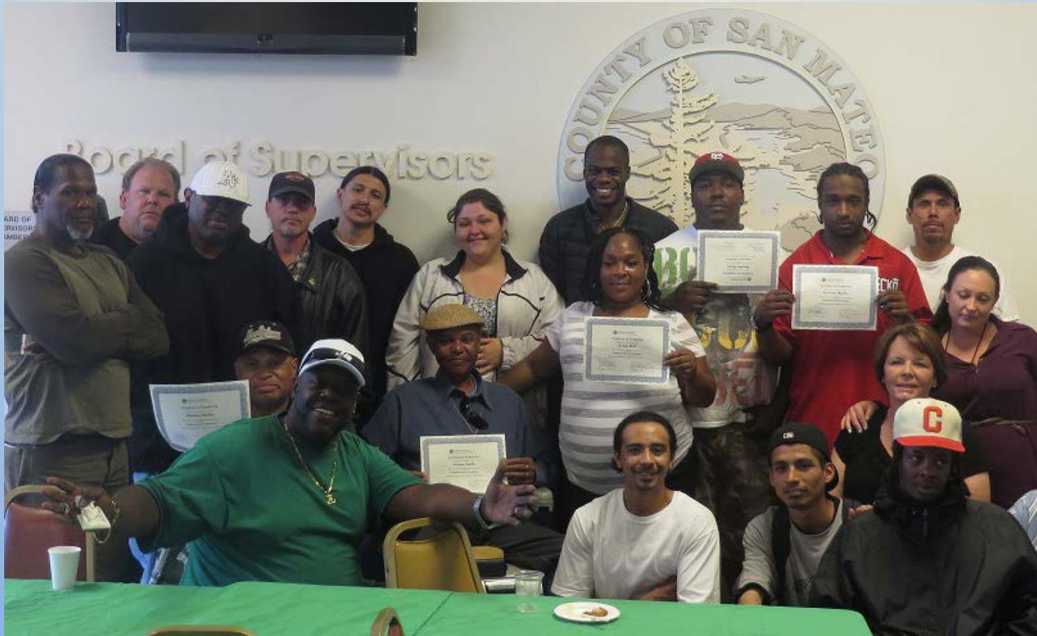
AB 109 clients that completed their probation supervision