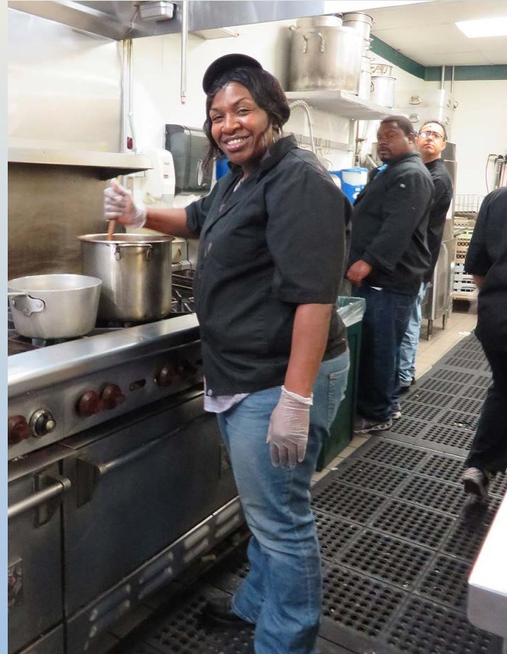
AB 109 client working at the Catering Connection