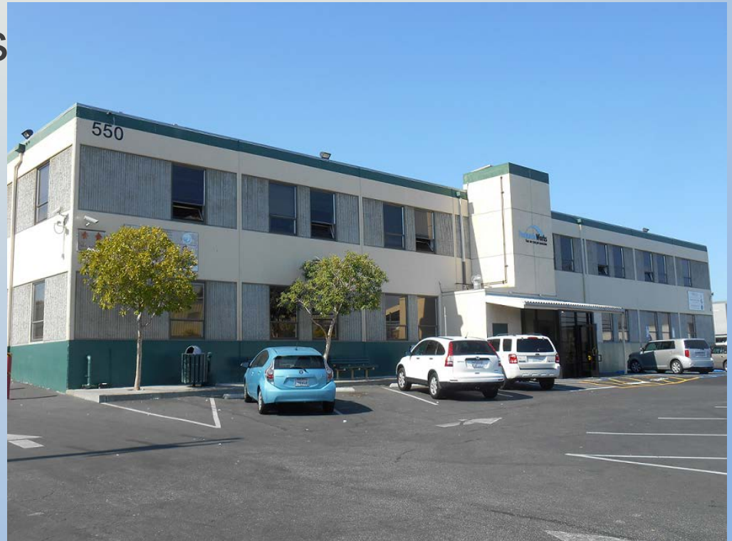
Service Connect office