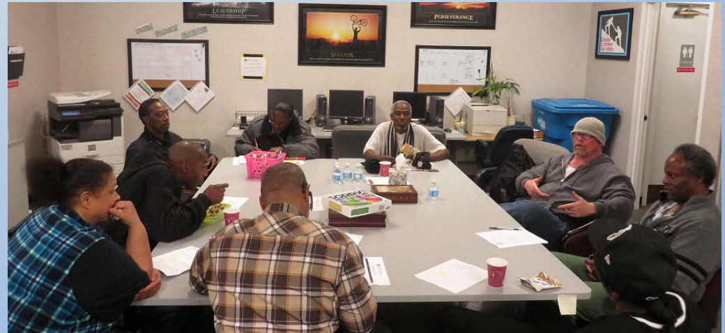
Service Connect support group meeting